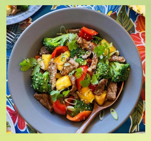
Beef Niblets for Chop Suey 2/5# Item # 113040