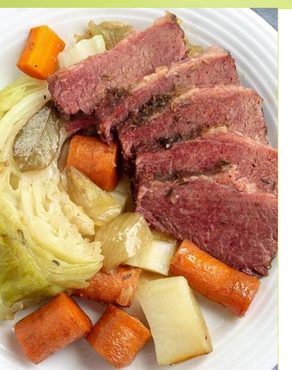
Corned Beef Brisket 2/17# avg. Item # 145610

St. Patrick's day in June? No, but this versatile product is great for sandwiches and does well as a weekly favorite. Flocchini Family Provisions makes this in-house following our old family recipes, made with as few ingredients as possible to create this delicious treat! Simple to make and yet can be used in so many dishes.