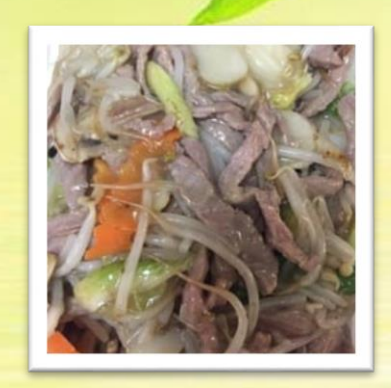
Pork for Chop Suey 2/5# Item # 128345

St. Patrick's day in June? No, but this versatile product is great for sandwiches and does well as a weekly favorite. Flocchini Family Provisions makes this in-house following our old family recipes, made with as few ingredients as possible to create this delicious treat! Simple to make and yet can be used in so many dishes.